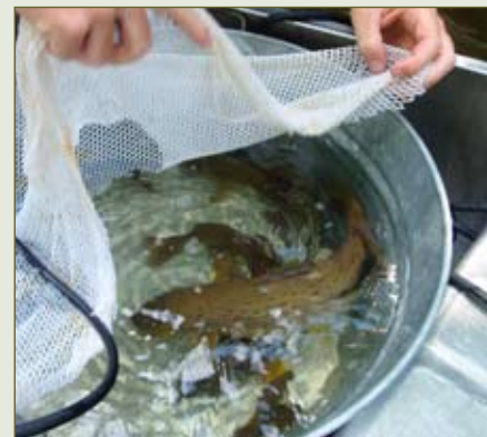
A crew of biologists and technicians from the VT Fish and Wildlife Department and the USFS-GMNF Fisheries and Wildlife Program conducted the electro-fishing survey on July 17, 2008.

After the official shocking was completed, a non-scientific evaluation of the habitat introduced last fall was conducted. This involved quickly moving through (i.e. electro-shocking) various structures to confirm the presence of trout to verify that our finny friends are using the newly established cover. This was indeed the case as most structures held trout (and more than a few of them were of considerable size).